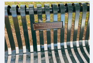
Plaques are available at an additional price if interested.