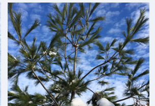
Evergreen trees add year round color and beauty.