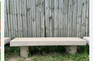
Concrete base will be required for installation