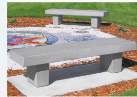
Bluff Trail Bench Style

Our Trail Benches are 6 feet long. Made of precast concrete, these benches will wear well in the elements and are heavy and solid. The bench is reinforced with 3/8 inch diameter steel rebar. Once the location is agreed upon, our team will plan the installation as weather and conditions allow.