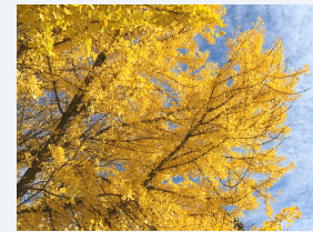
We have multiple choices of deciduous trees .

Our tree options vary from year to year and the team will assist with what tree varieties will thrive in each location. Choices are subject to location and environment. Once the location and variety is agreed upon, our team will schedule the installation as weather and conditions allow.