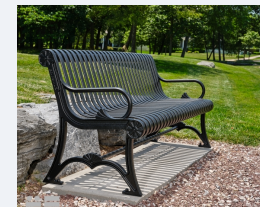
6 or 8 foot Metal Park and Green-Space bench.

Our Park and Green-Space Bench is available in both 6 and 8 foot lengths. Arm rests are on each side and the bench is made of steel. Once the location is agreed upon, our team will schedule a concrete pad installation for the bench. After that is set, the bench itself will be scheduled for install at the site as weather and conditions allow. A plaque is available for an additional fee.